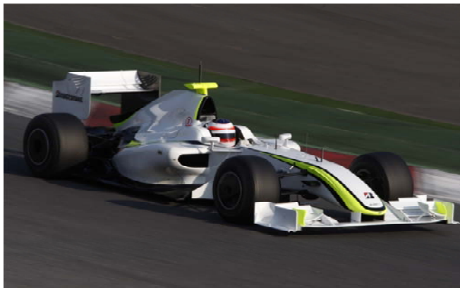
Yas Marina Circuit in Abu Dhabi was completed for the first Formula One Grand Prix Race on 1 November 2009.

We are confident that our confirmed workload and significant potential projects will provide an extremely exciting environment for BWS in the years ahead. We would appreciate the opportunity of demonstrating our knowledge and understanding of sports projects with yourselves in the future.